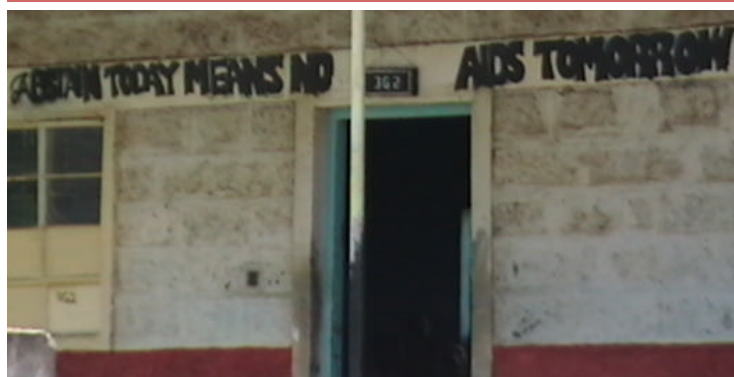
‘ABSTAIN TODAY MEANS NO AIDS TOMORROW’

AIDS prevention slogans, such as this one painted on the walls of Moi Secondary School, are found throughout Kenyan schools. In Kenya, children begin learning about the causes of HIV/AIDS when they enter primary school and continue learning about it throughout secondary school (another reason education is so important). Poli, poli , (slowly, slowly) a difference is made and lives are saved.