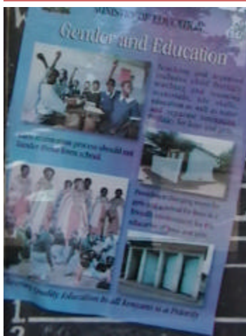
‘GENDER and EDUCATION’

This poster, promoting gender equality, hangs on the wall of Olokirikirai Primary School. Progress!