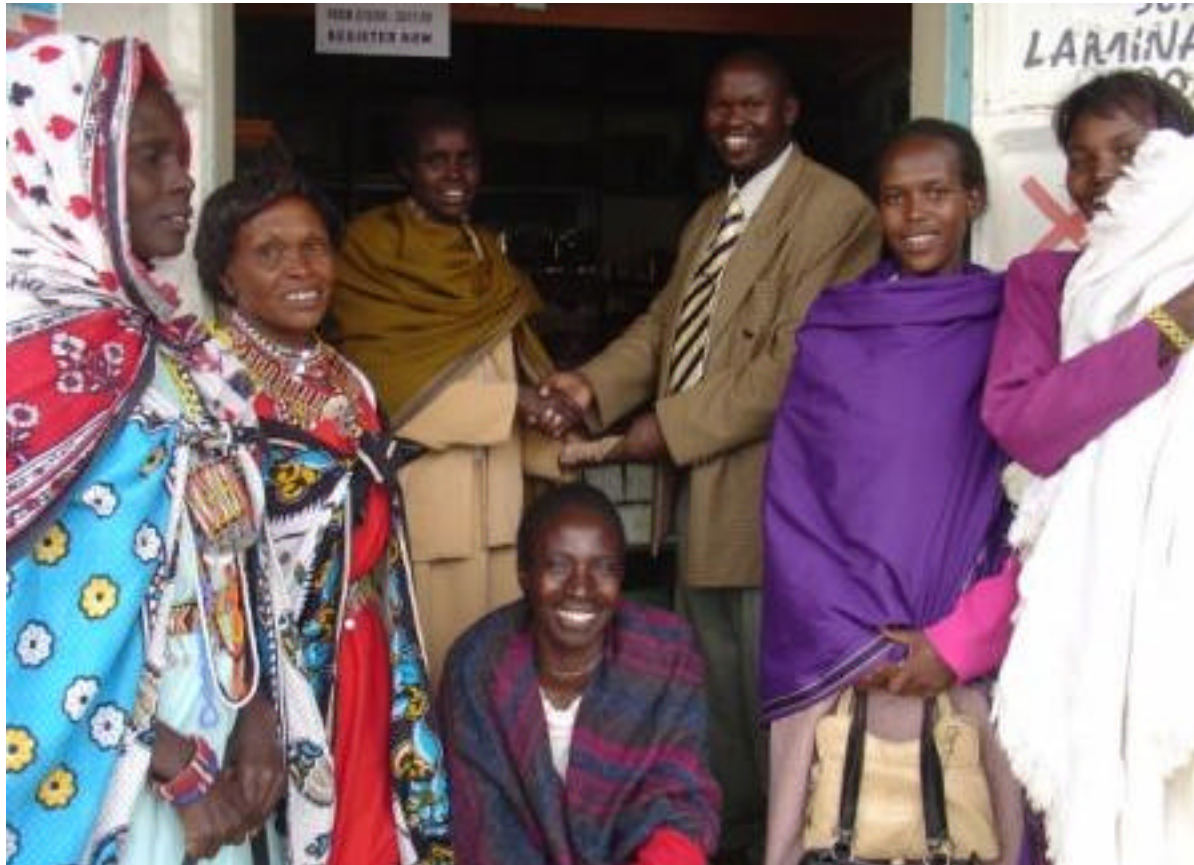
Kiramatisho (caretaker) Women's Group, Oimerru, Kenya

In November of 2009, after attending OFDC sponsored women's training on basic health, HIV/AIDS awareness, women's rights under Kenyan law and simple business, this group of rural Kenyan women received a microcredit loan of $900 to purchase 30 goats. With OFDC-funded revolving loans now under the direction of the mamas in Talek and Kitale, OFDC is establishing microcredit in the Narok area. The Kiramatisho Women's Group is our pilot group.